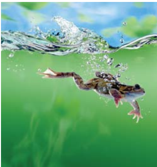
W A T E R